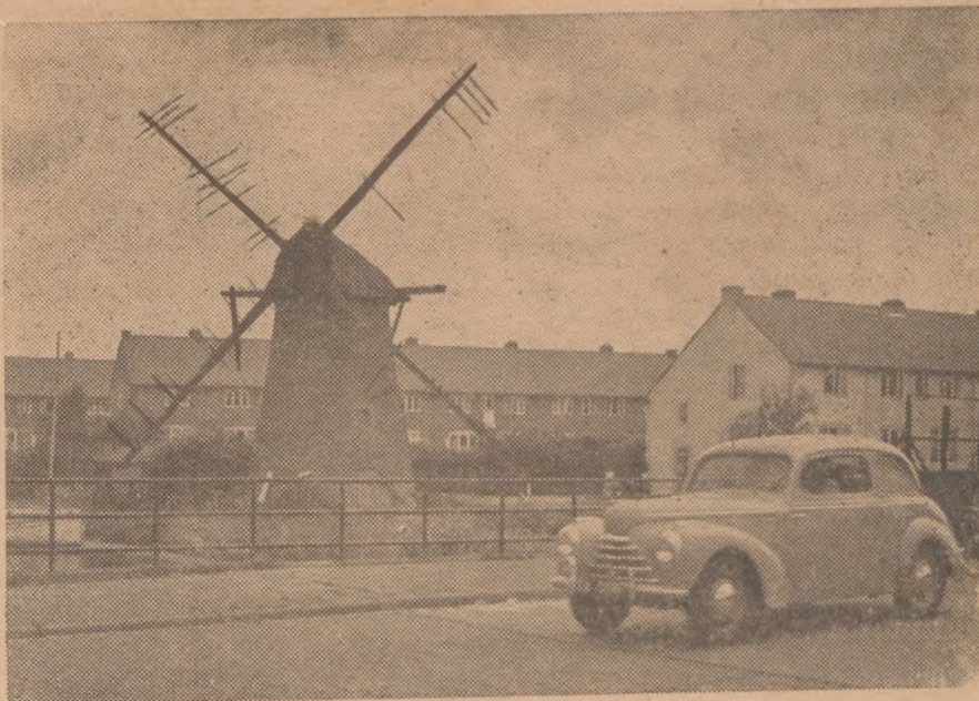
ALKMAAR BUYS A WINDMILL.

Excelsior Community Brass Band Club or Phone 5228.